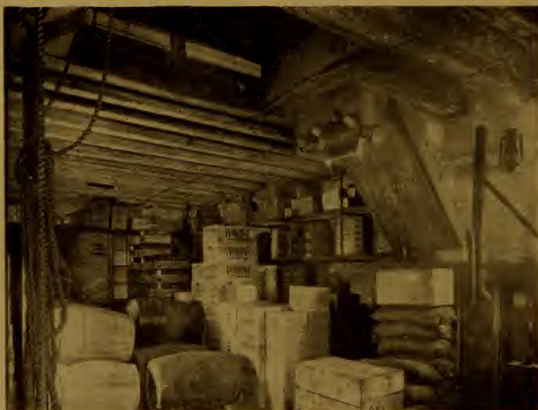
Interior of Store Room of Stearns & Crosby, Chatham Street, corner of Chatham Row (Has not been changed since 1832)